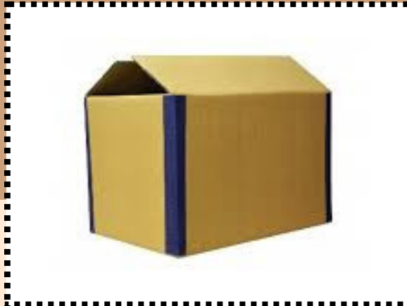
Calico corrugated Box