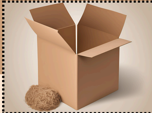
SQUARE CORRUGATED BOX